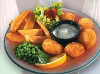
Scampi Tender & Succulent