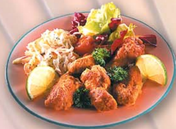
Chicken Wings Plain, Buffalo, Teriyaki or sweet & Sour