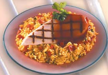
Chicken Breast Plain, Teriyaki, BBQ or Char Sui