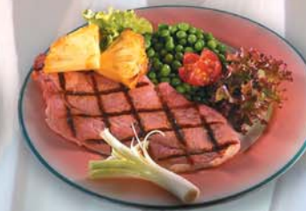
Gammon Choice, Cut, Char grilled