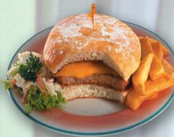
Sausage Burger With Cheese if you wish