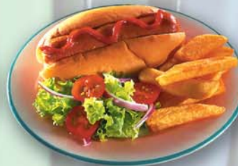
American Hot Dog With fried onions if you wish