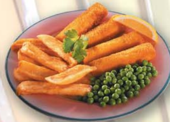
Fish Fingers Traditional Favourite