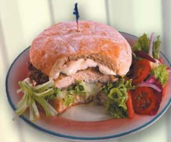
Chicken Burger Southern Style Coating with Honey Mustard