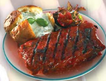
Damon's Ribs Available BBQ or Char Sui

(*Excludes Burgers, American Hot Dog & Pizza. Not available as Kids Eat Free)