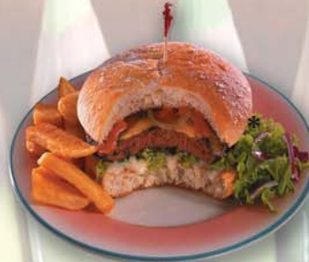
Damon Burger With Relish. Plus Cheese if you wish