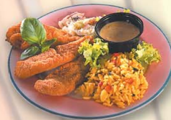
Chicken Tenders Tender Breaded Chicken