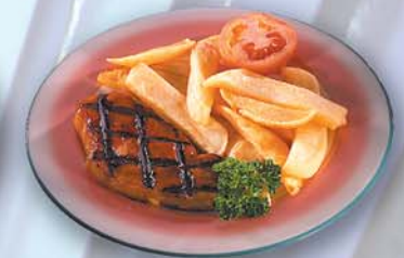
Pork Loin Plain, Teriyaki, BBQ or Char Sui