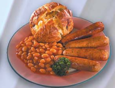
Pork Sausages Kids favourite