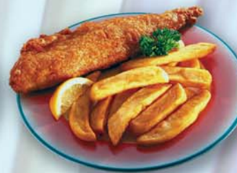
Fillet of Fish Delicious White Fish (May contain small bones)